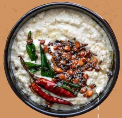
Fresh Coconut Chutney