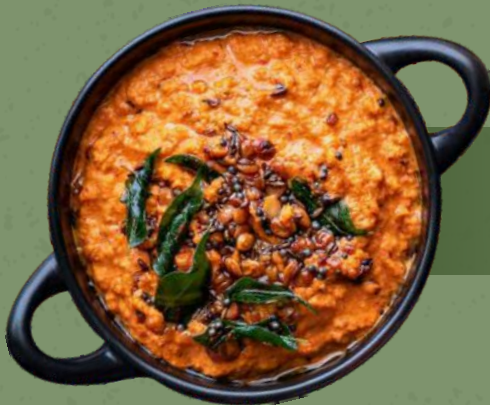
Chutney & Dips