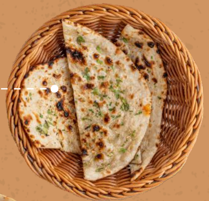
Chili Corriander Naan