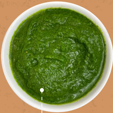
Coriander & Mint Chutney