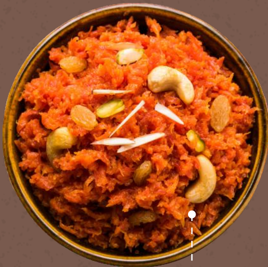
Gajar Ka Halwa