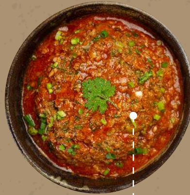
Onion & Tomato Masala