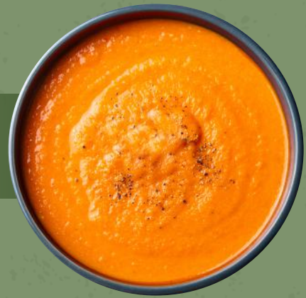
Gravies & Sauces