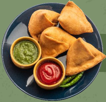
Appetizers & Snacks