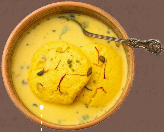
Kesar Pista Ras Malai