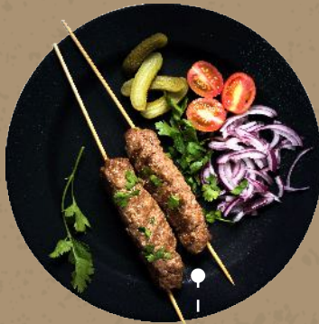
Veg. Seekh Kebab