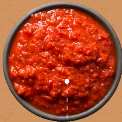
Red Garlic Chutney